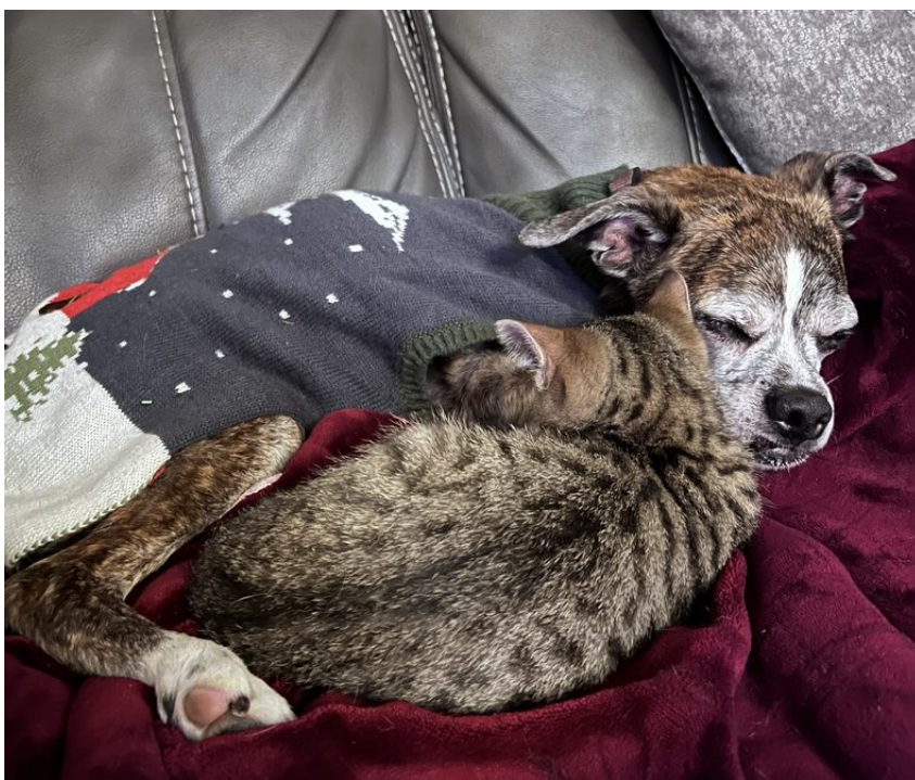
Max, April 20, 2009 - May 17, 2023

The May long weekend was spent building a fenced in area for the dogs. The dogs can now take the stairs off the deck to a small grassy area. The space is 256 square feet, not huge but enough for them to stretch their legs and play. It also means they have somewhere to go to the bathroom other than the deck! I think the dogs will enjoy having this extra bit of green space. Walks will still be our main source of exercise but it sure is nice to be able to let